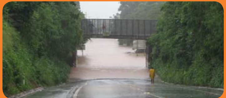
The existing Mulgrave Bridge goes under during the 2008